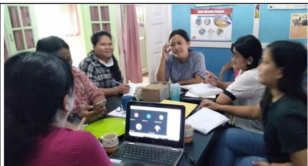
Consultations with NGOs – face to face as well in virtual manner