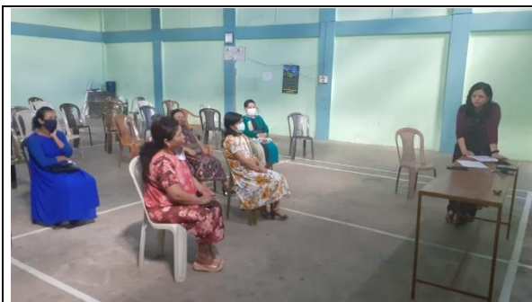
Consultation with Women's group

The key concerns as voiced by various stakeholder groups are presented in Annex-II, and further informed the ESMF and project preparation by instituting specific measures targeting poor and vulnerable population and those living in remote areas.